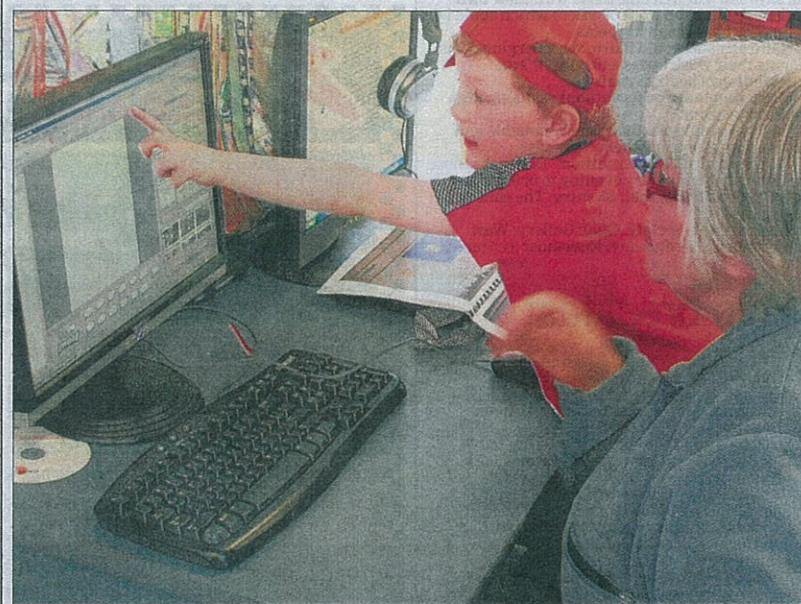
COMPUTERS are a popular choice at Carlyle Kindergarten.